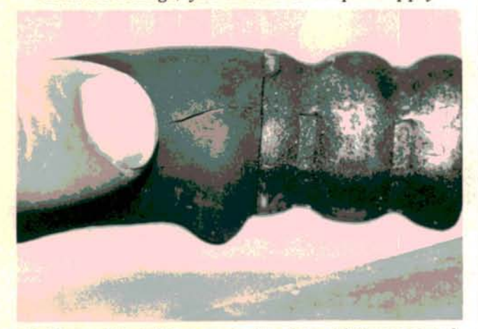
Most hoses fail right here, near the fitting. If there's enough slack in the hose and enough working room around the hose, just cut off the damaged hose end and crimp on a new fitting right on the car.

Besides fittings, you'll have to keep a supply of