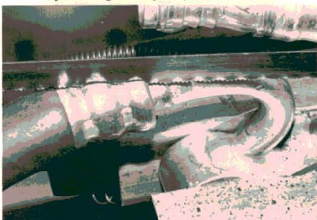
We'll reuse this fitting just for photography's sake, okay? If it were reusable, you'd cut off the old crimping collar and remove the hose. Then lube the fitting and push on the new hose and collar.

hose and crimping collars on hand. The four common hose sizes (size 6, 8, 10, and 12) cover the range of import and domestic systems. Of these four sizes, 8 and 10 are the most popular. Depending upon the manufacturer, you can get OE-quality hose in 15-, 25-, and