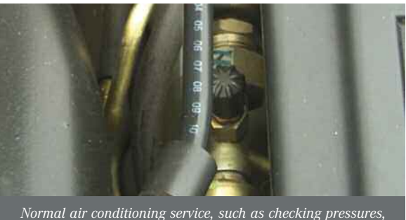
Normal air conditioning service, such as checking pressures, evacuation and recharge can be done just as on any vehicle. The heating and air conditioning systems, while integrated by the system control unit, are mechanically independent.

Air conditioning subsystems have used R134a since concerns were first raised about the climatic effects of R12, but the different refrigerant systems work in the same way. Differences correspond to the different refrigerants' heat-transfer capacities and pressures. Observe all the standard precautions to detect and prevent contamination of the refrigerants, including the air conditioning oils specific to and compatible with each refrigerant, different service fittings and so on. Mercedes-Benz vehicles