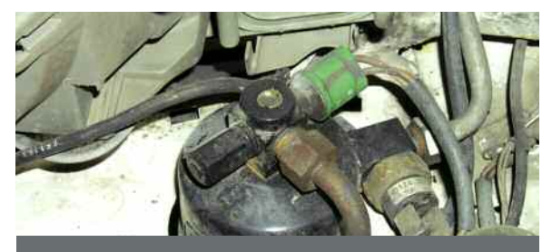
Most Mercedes-Benz vehicles' air conditioning systems use a conventional sight-glass in the refrigerant line to determine when the proper charge level is achieved. With R134a, recall, you don't wait for the very last bubble to disappear.

If the driver starts the engine under conditions requiring air conditioning, the compressor engages shortly after the engine idle stabilizes, and the climate control system works to drive the passenger compartment temperature down to the 'maintenance' threshold. The control unit cycles the compressor as needed to achieve the set temperature without freezing the air conditioner evaporator. The air conditioning system is an expansion-valve design.