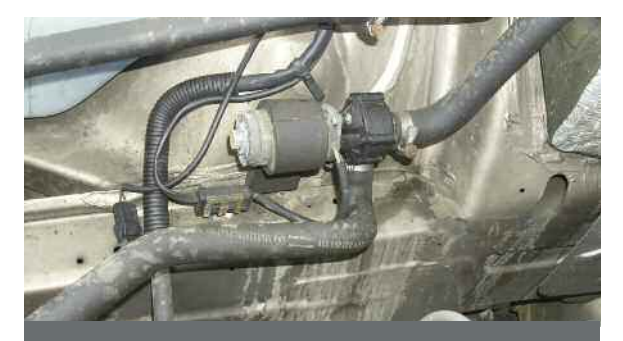
Two electrical components play important and interconnected roles for heat and defrost. The auxiliary water pump, top, circulates coolant through the heater core as needed regardless of the circulation through the engine's main water pump. The monovalve, bottom, opens or closes the coolant's hydraulic circuit to and from the heater core.