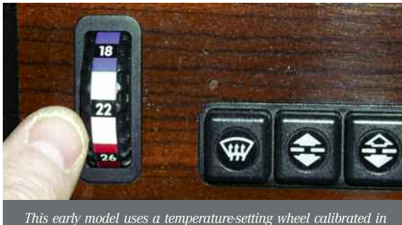
centigrade; later versions use flip-flop centigrade/Fahrenheit selector buttons. This control tells the system what to pursue.

As one of the first automotive manufacturers offering a fully integrated vehicle heating and cooling system, properly described as an automatic climatecontrol system, Mercedes-Benz has used subsystem mechanisms very similar from one model to another for many model years. Virtually all of the company's recent cars use variations of this system, with the exception of some early 190's (Model 201).