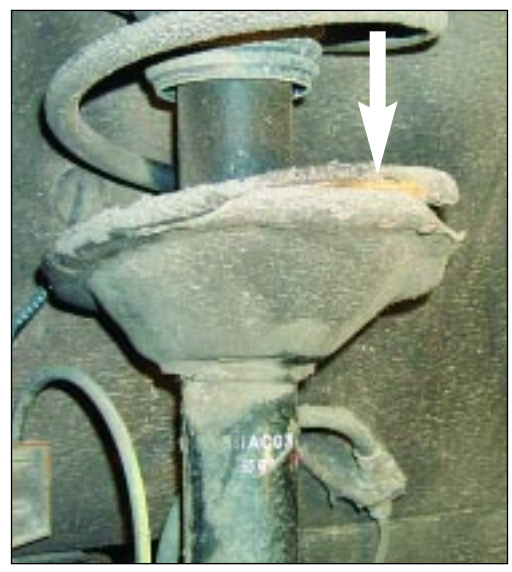
Inspecting Spring Near Seat (arrow)

In this case, the vehicle owner will be advised that the front springs were replaced as an alternate repair method because the vehicle had non-OE (aftermarket) replacement front struts and the Front Spring Guards would not properly fit. Replacement of aftermarket front struts with new OE struts, in order to install Front Spring Guards, are not covered by this recall.