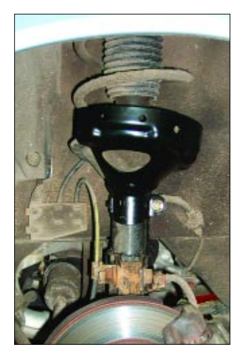
Front Spring Guard