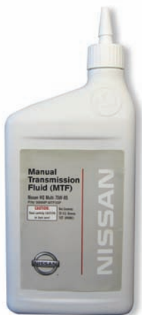
Nissan Genuine Manual Transmission Fluid