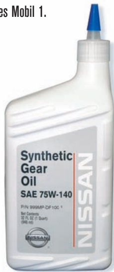
Nissan Genuine Synthetic Gear Oil