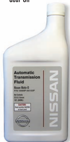
Nissan Genuine Transmatic D

If you do this before starting work on the car, you'll know the fluid type and capacity. Then, you can check stock and order if necessary so you won't accidentally install the wrong fluid in a customer's car.