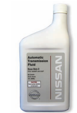
Nissan Genuine Transmatic D