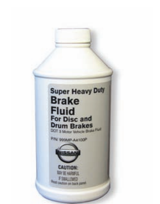
Nissan Genuine Brake Fluid