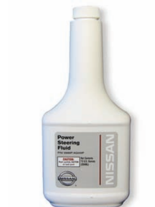
Nissan Genuine Power Steering Fluid