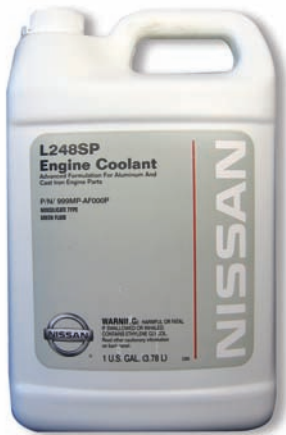
Nissan Genuine Coolant

Nissan recommends the use of Genuine Nissan 5W-30 Ester Engine Oil in 2009-2010 Maxima engines. It is also recommended for most Nissan/Infiniti vehicles 2008 MY and later. The GT-R uses Mobil 1.