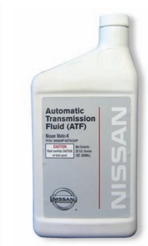
Nissan Genuine Transmatic K