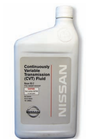
Nissan Genuine Trans CVT