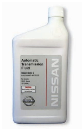
Nissan Genuine Transmatic S