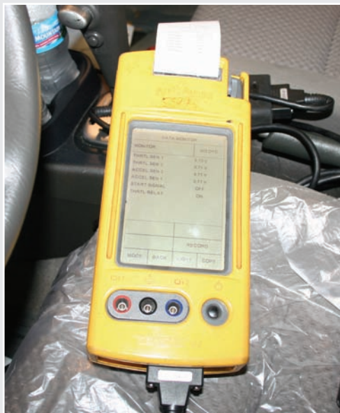
The Consult II unit can be used on 2006 and earlier models.