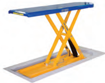
The SPEED Plus Frame & Lift from the CAR-O-LINER Company.

Each of these alignment systems has unique qualities and offers a range of purpose, sophistication, accessories and value. All are available through the Nissan Tech-Mate website at www.nissantechmate.com .