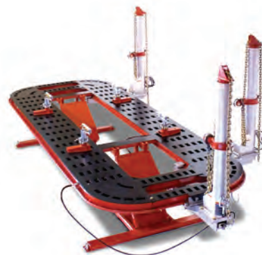
The Power-Pro series repair rack from Blackhawk.