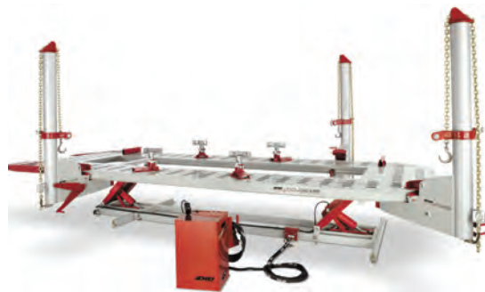
The Impulse System from Chief Automotive Technologies