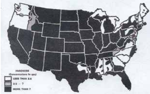
This map indicates that most of the country has hard water.