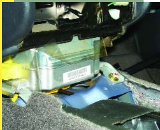
Airbag Control Module