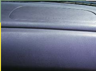
Passenger Airbag Module