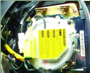
Driver Airbag Module