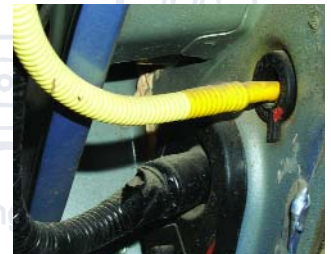
SRS Wiring Harness