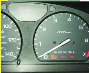
Airbag Warning Light