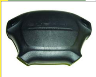
Proper Module Handling