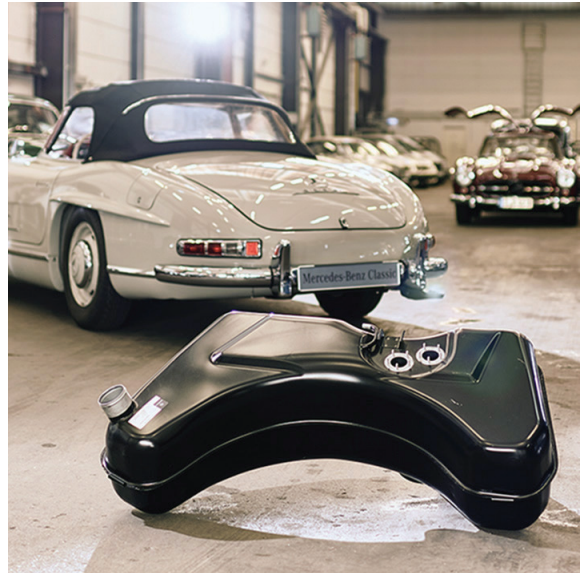
The Mercedes-Benz Classic Center specializes in both hard-to-find and common parts for older models. Here we see a fuel tank for the W198 Gullwing.

Classics are vehicles that have been out of production for about 20 years. For example, the Model 210 was last produced in 2003, and soon the Classic Center will become responsible for the model. Also note that the original Mercedes-Benz Classic Center located in Fellbach, Germany serves as a partner to the Classic Center California, and they share product knowledge and expertise regularly.