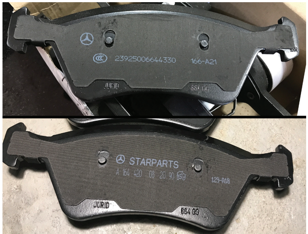
Comparing the StarParts brake pad (bottom) to the standard part, the only visible difference is the text printed on the backing. From the friction material side, we couldn't tell them apart.

When we explain the benefits of using StarParts to our shop's customers, they almost invariably ask us "But what am I giving up?" The answer is nothing—at least nothing important. As an example, let's take a close look at front brake pads and disks for a 2006, which we recently replaced for a customer.