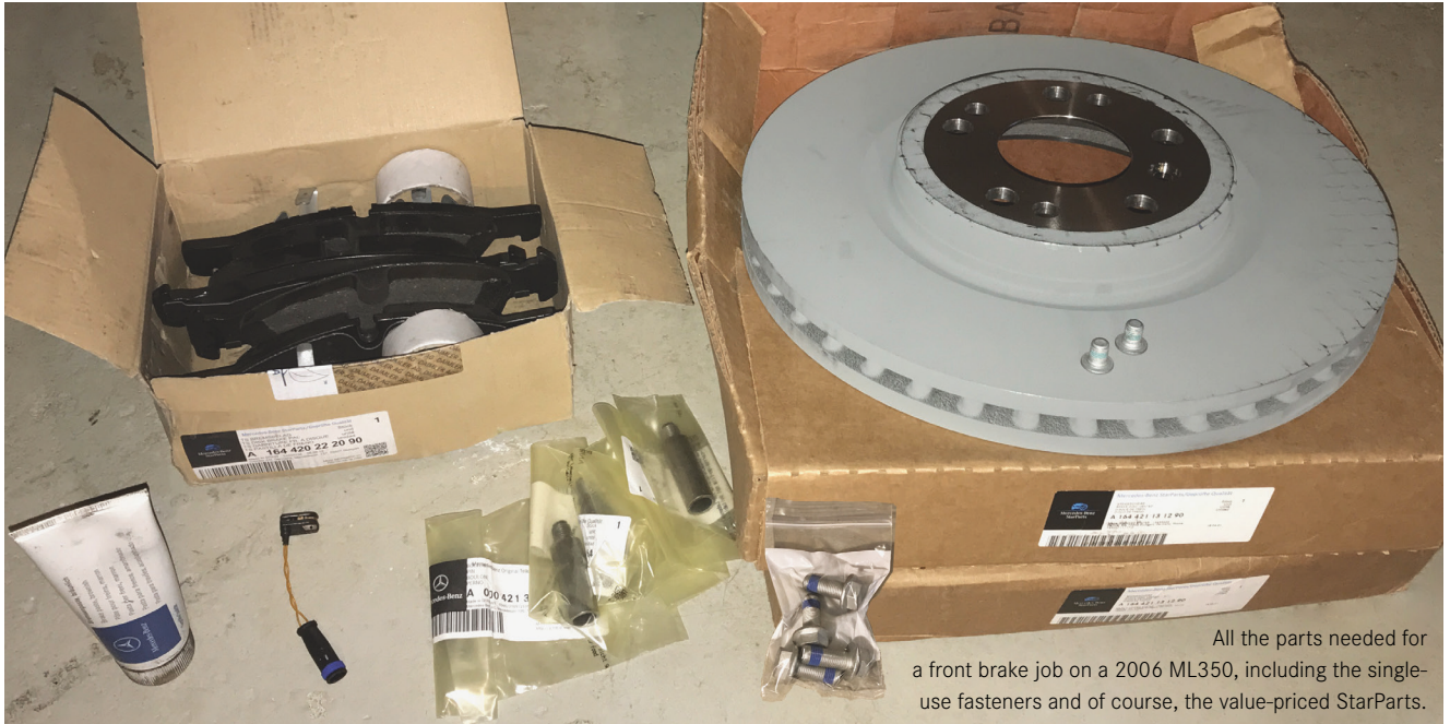
All the parts needed for a front brake job on a 2006 ML350, including the single-use fasteners and of course, the value-priced StarParts.

Cover image: StarParts from Mercedes-Benz bring benefits to both your shop and your customers. Ask your dealer about them.